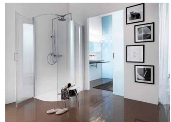
B4966ULUTR version with door B4966ULUTR-B